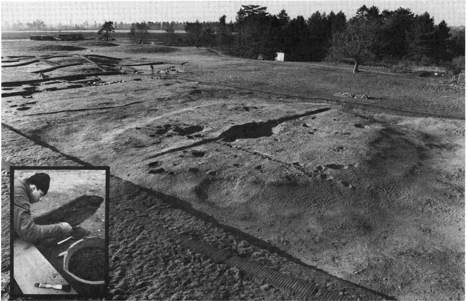
Sutton Hoo : Mound 2 after excavation, in autumn 1988. Central burial chamber and quarry ditch visible, also fenceline, ditch and postholes of the prehistoric settlement. (Inset) Excavation of a grave beside Mound 5.