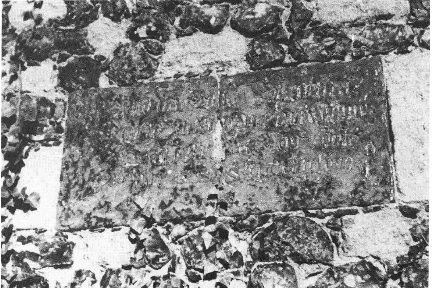
Ixworth church : the 'William Densy' tile.