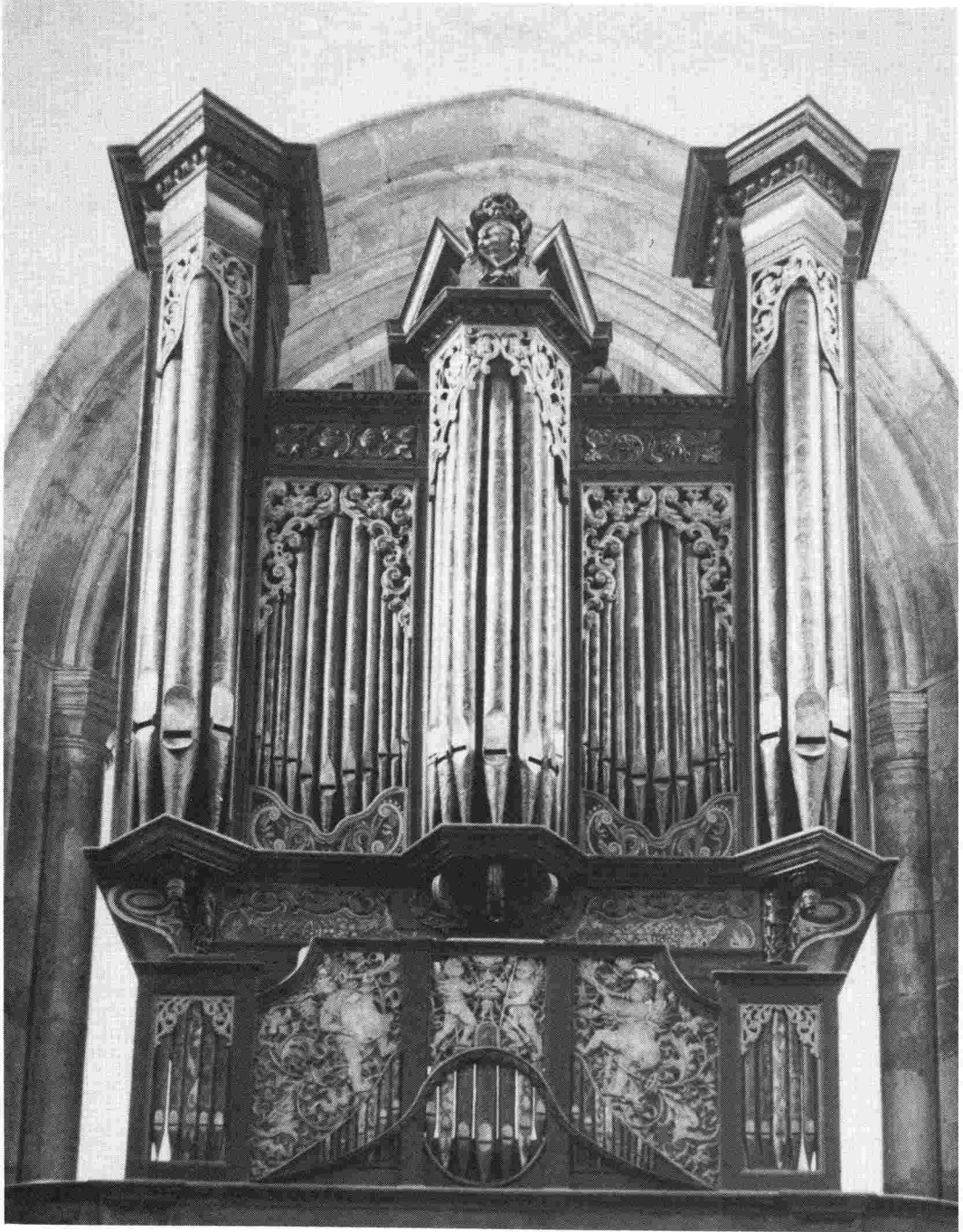
Framlingham : the organ and gallery.