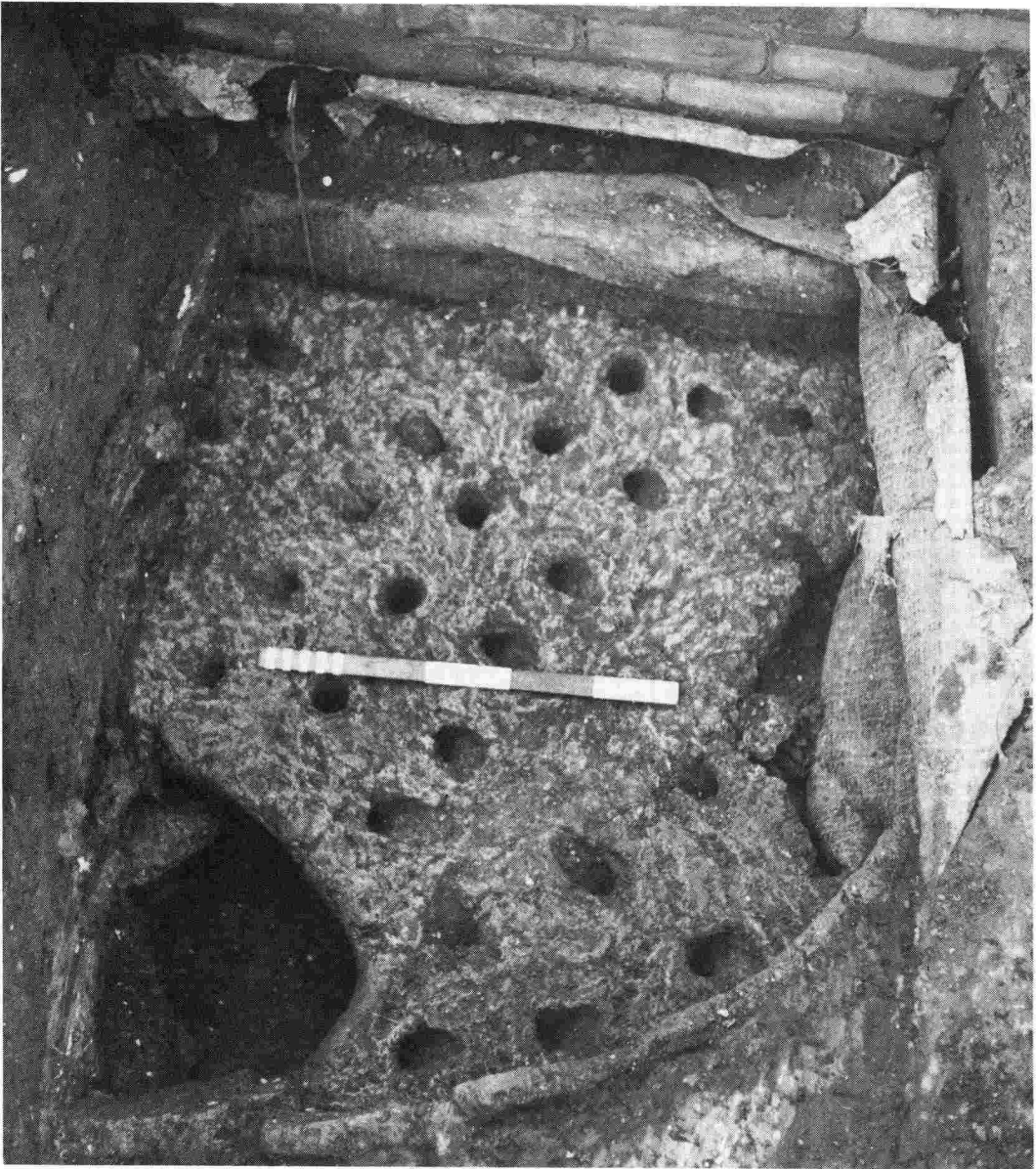
The pottery kiln at Stowmarket after excavation, looking south. The modern wall foundations can be seen at the top and right side of the picture.